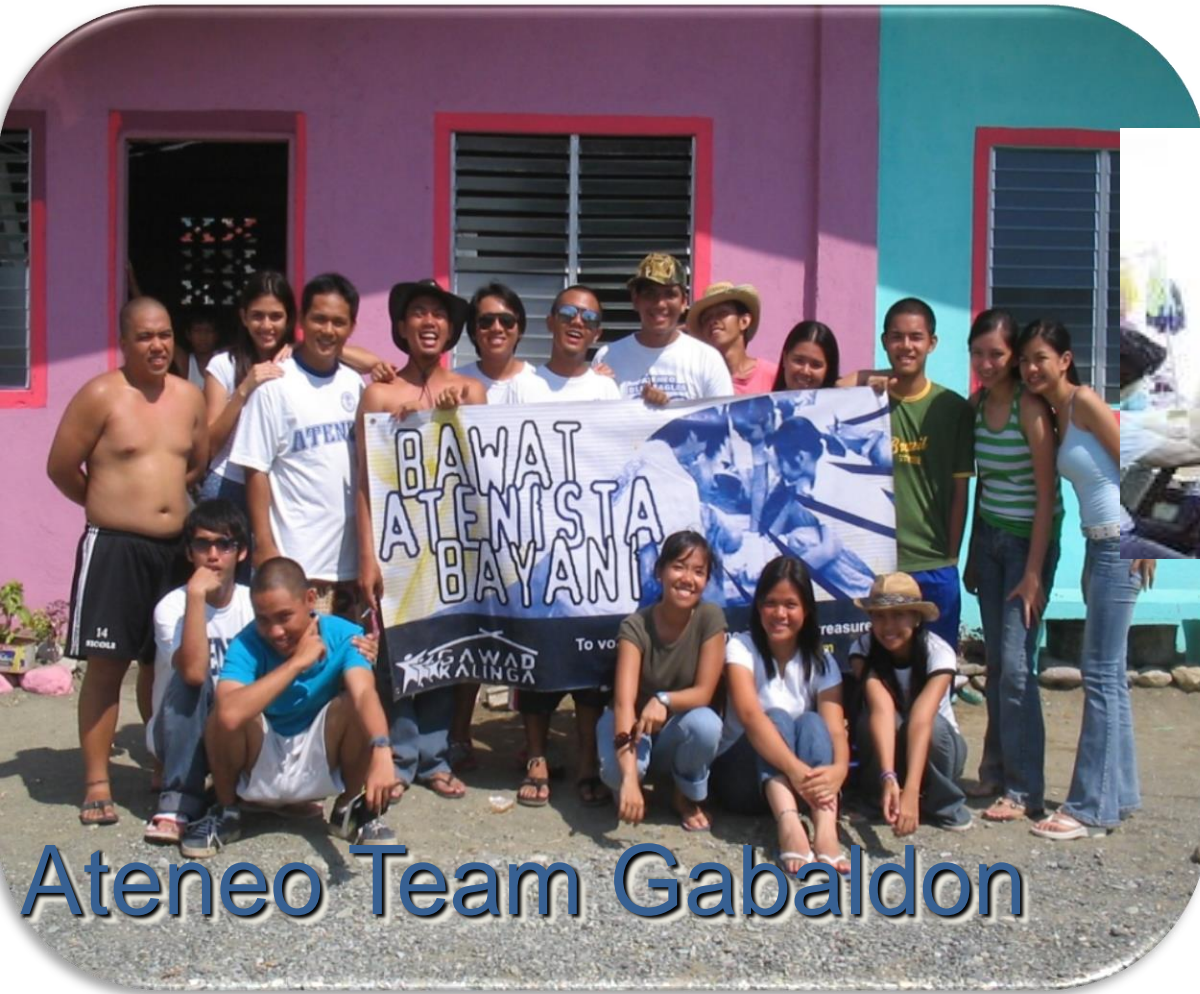
Ateneo Team Gabaldon

Through shared reflections and stories, they found family, meaning, life purpose.